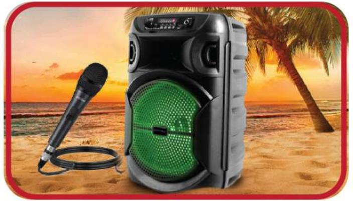
MUSIC SOUND SYSTEM