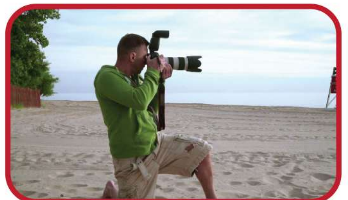
PHOTO / VIDEO-GRAPHY