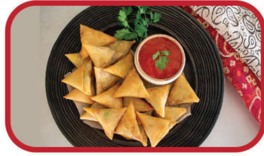
ONE BITE SAMOSA